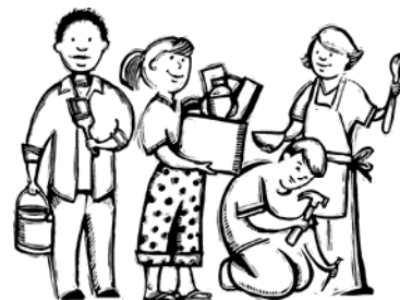
Confirmation Service Project

Canned pineapple Box of Brown sugar Canned Green Beans Bag of Fresh Potatoes Jello or Pudding Can of Juice (any flavor) Boxed Bread Mix An Easter Card